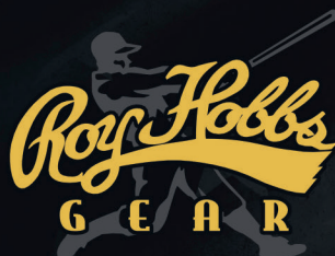
Tidewater Drillers bat flip

VISIT THE ROY HOBBS GEAR STAND AT THE PLAYER DEVELOPMENT COMPLEX