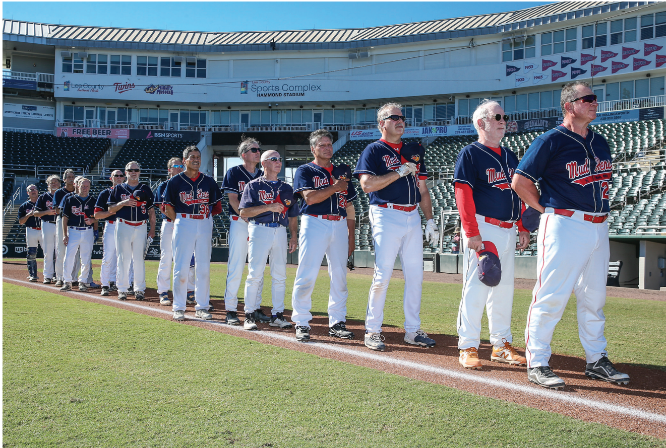
Kent Mudhens 60's honoring America prior to their game against the San Antonio Texans