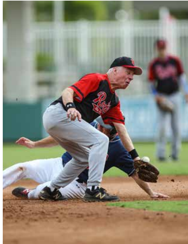
Kent Mudhens runner slides safely into 2nd base vs. the Rhode Island Rockies