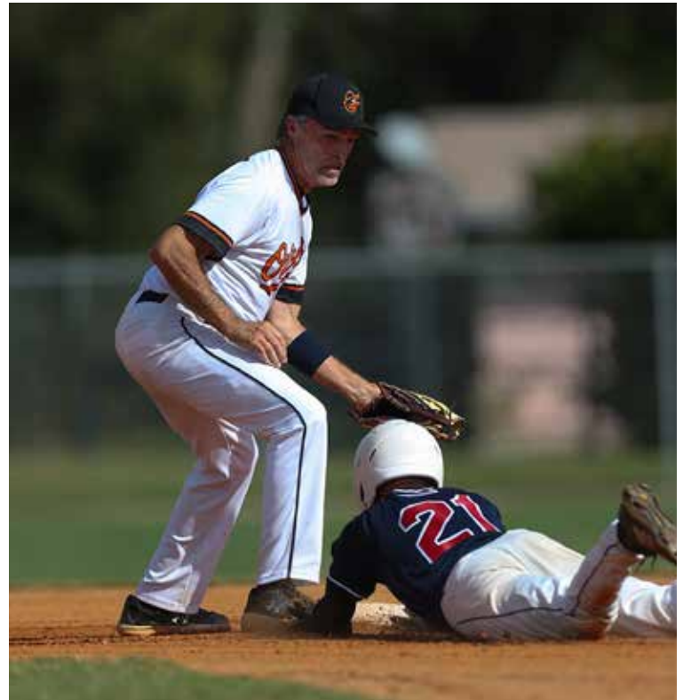
Kent Mudhens 65's baserunner slides safely into 2nd with a double vs. the Baltimore Orioles

Ironman Maidens 16, South Dakota Rushmores 11 Maine Woods 19, Toledo Tigers 0 New England Red Sox 6, White Foxes 5 Team America 12, New Jersey Wonderboys 5 Team Cambria 19, Avengers 1 Tri-Cities 15, Kent MudHens 6