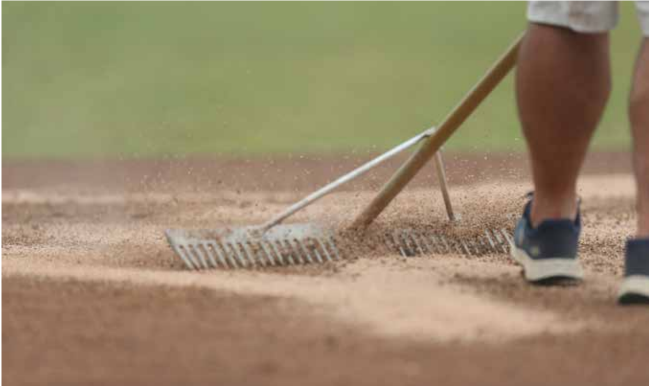
RHWS grounds crew getting the field ready for another game.