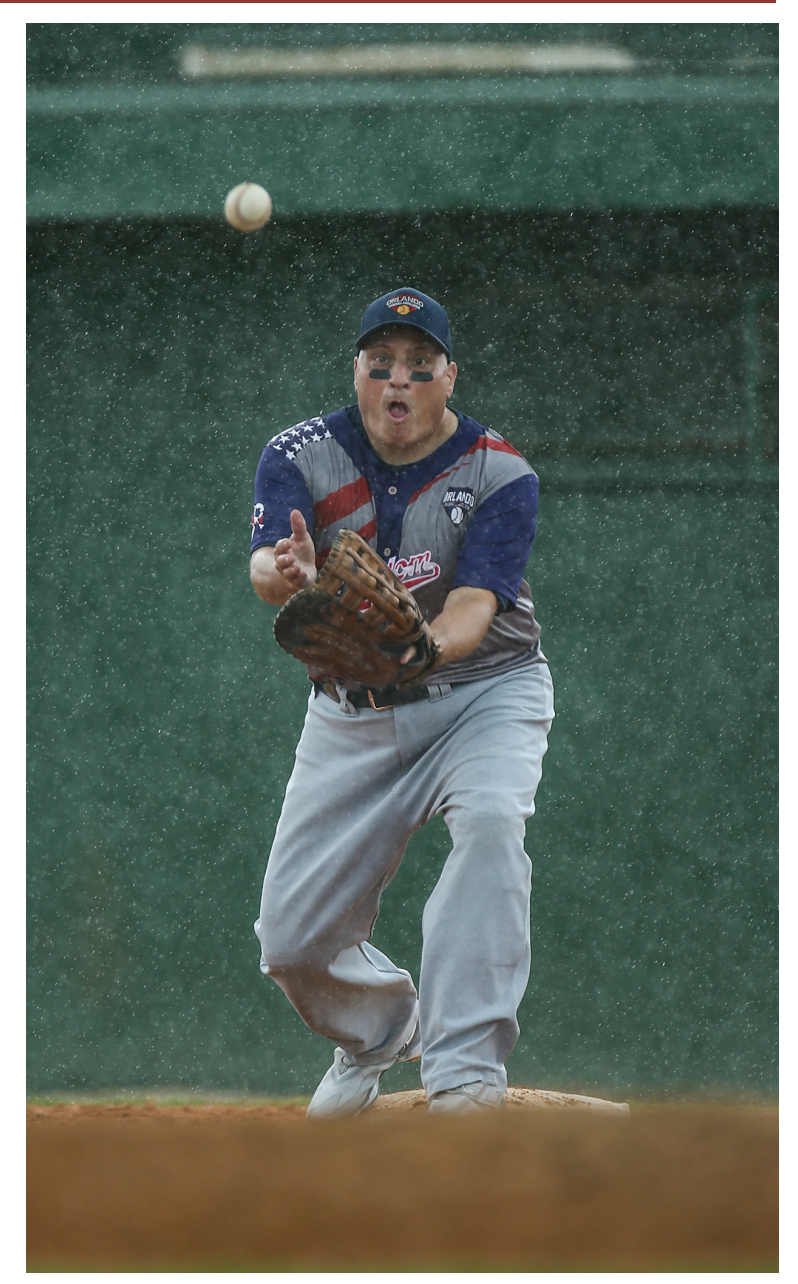
Orlando Freedom 1st baseman takes the throw in the rain vs. the Tidewater Drillers

In case of an emergency, contact the field manager at your site. He has the First Aid supplies and will contact 911 services as needed.