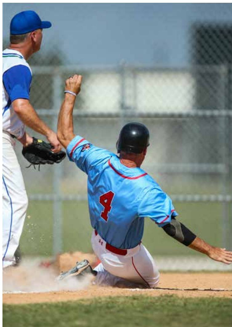
Chi-Tenn baserunner scores on a wild pitch vs. the Florida Sharks

Americans Baseball VS New Jersey Twins, JBSt Maine Black Bears VS DC Pirates, LC2 Banana Sharks VS Florida Sharks, LC3 Minnesota Cardinals VS Orlando Blazers, LC4 Bergen Yankees VS Baltimore Thunder, LC6 DuPage Red Sox VS Westchester Fury, LCSt Canton Tigers VS USVI Hurricanes, TP2 Atlanta Baseball VS Okaloosa Slammers, TP4 Philadelphia Generals VS Chicago Jacks, TPSt Chicago Knights VS RIMA Foxes, PDC1 Wright Field Reds VS Chicago Pilots, PDC2 Chesapeake Rays VS Akron Summa Ortho Brewers, PDC3 Long Island Patriots VS Jersey Bananas, PDC4 Minnesota Bandits Red VS Carolina Thunder, PDC5