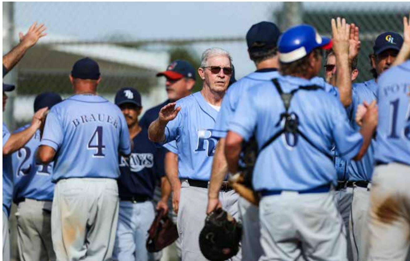
Sportsmanship: Chesapeake Rays and Cuyahoga Indians