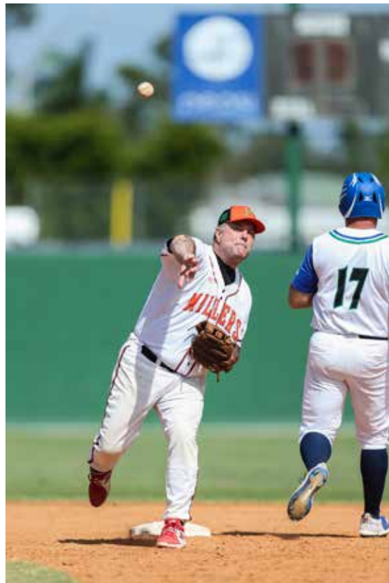
Minneapolis Millers turn a double play vs. the Florida Sharks

Akron Summa Ortho Brewers 12, Chicago Knights 11 Atlanta Baseball 24, St. Louis Owls 3 Baltimore Thunder 14, DuPage Indians 4 Bergen Yankees 13, Minnesota Goats 7 Canton Tigers 16, New Scotland Giants 0 Carolina Thunder 9, Orlando Blazers 8 Chi-Tenn Woodpeckers 15, PSOF Rangers/ HYB 12 Chicago Pilots 16, Long Island Patriots 6 Crystal Clinic Wolfdogs 12, Jersey Bananas 4 Cuyahoga Indians 13, New Scotland Giants 1 Cuyahoga Indians 17, Chicago Jacks 7 DC Pirates 10, Canton Tigers 4 DC Pirates 10, Chesapeake Rays 0 DuPage Redsox 19, Okaloosa Slammers 11 Fort Myers Cubs 16, Chicago Knights 11 Fort Myers Cubs 20, Westchester Fury 6 Glory Days 13, Minnesota Bandits Red 6 HPK Oilers 12, South Dakota Rushmores 5 Huntsville Havoc 10, Albany Capitals 1 Lansing Blue Jays 4, Midwest Pirates 3 Maine Black Bears 8, Nova Scotia Monarchs 3 Milwaukee Rangers 10, St. Louis A's 3 Minneapolis Millers 15, Florida Sharks 12 Minnesota Cardinals 12, Baltimore Thunder 6 New Jersey Twins 16, Omaha Indians 7 Okaloosa Slammers 23, Philadelphia Generals 20 Orlando Brewers 14, ChicagoBay Warriors 0 Pittsburgh 11, Americans Baseball Club 3 Puerto Rico Cardinals 14, Oakville Golden A's 3 RIMA Foxes 5, Bergen Yankees 1 Salem-Pitt Warlocks 14, St. Louis Owls 4 St. Louis Patriots 14, Banana Sharks 4 Steve's Sports 17, Minnesota Bandits Gold 7 Steve's Sports 7, Albany Whiz 5