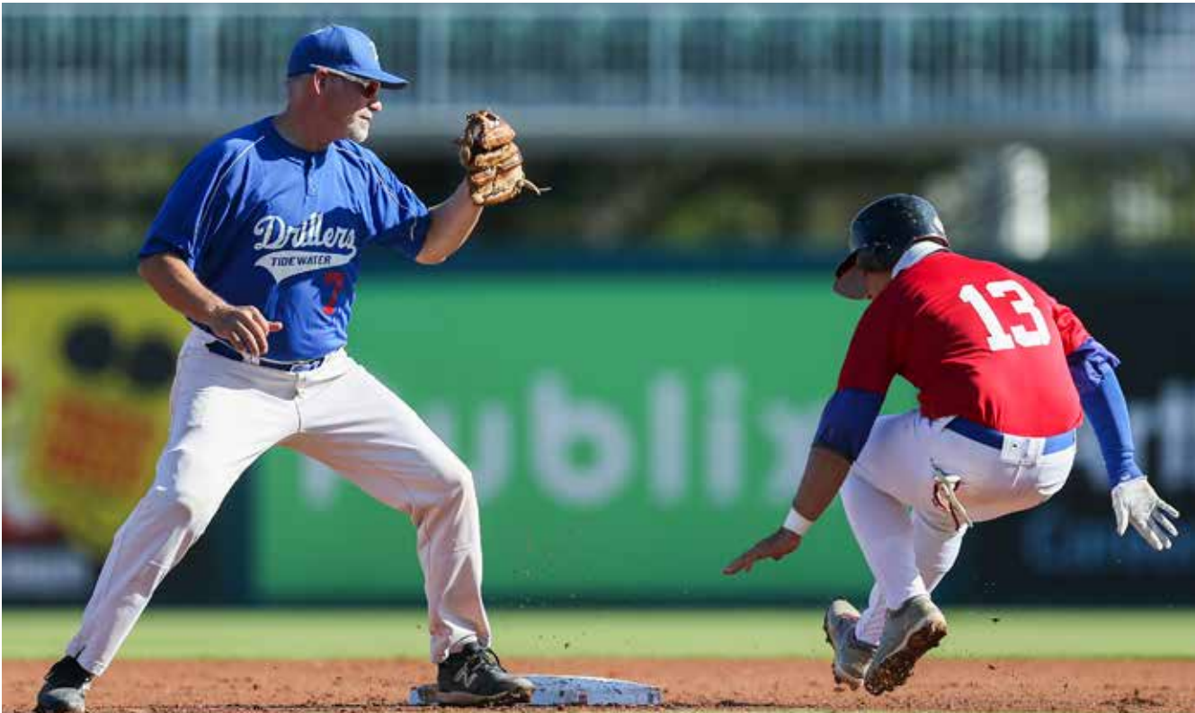
The Tidewater Drillers infielder was late in applying the tag to the Puerto Rico BoriSox baserunner