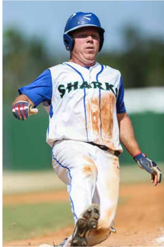
Florida Sharks runner sliding home vs. the Minneapolis Millers