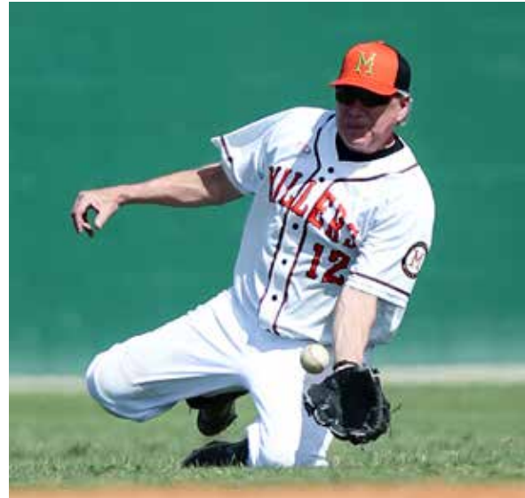
Minneapolis Millers center fielder makes a great sliding catch of a Florida Sharks fly ball