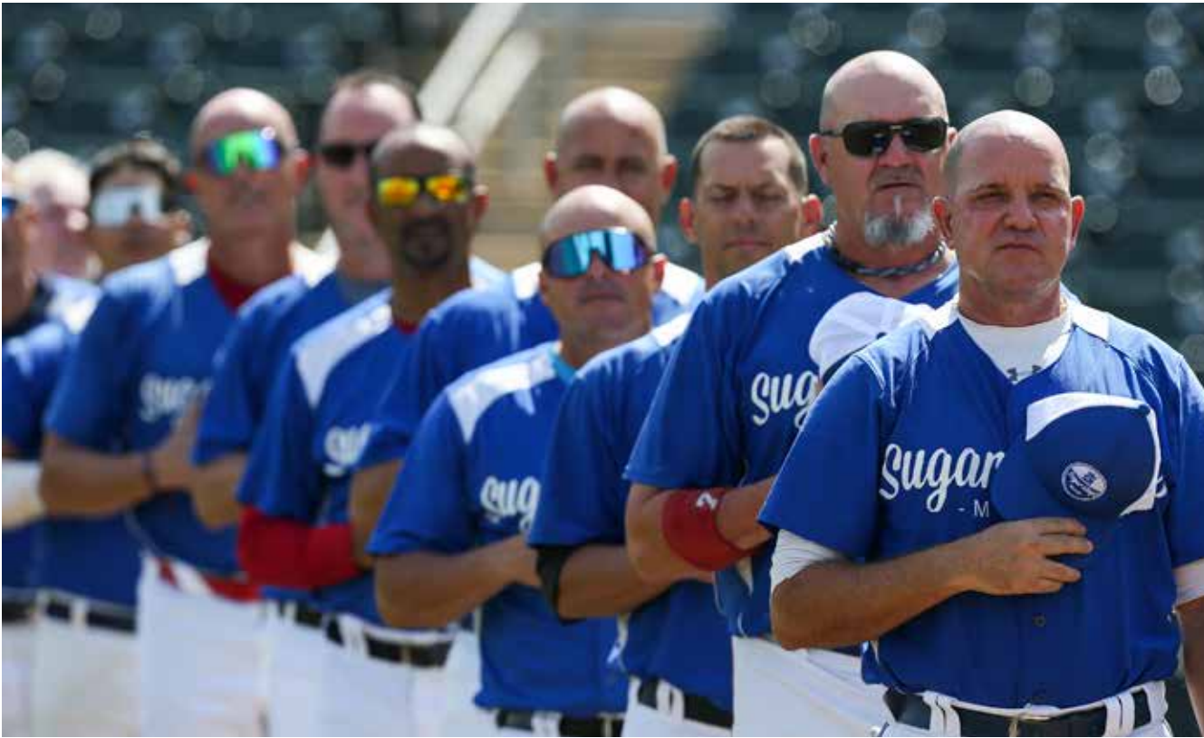
Miami Sugar Kings honoring our flag during the National Anthem prior to their game vs. the Chicago Woodpeckers