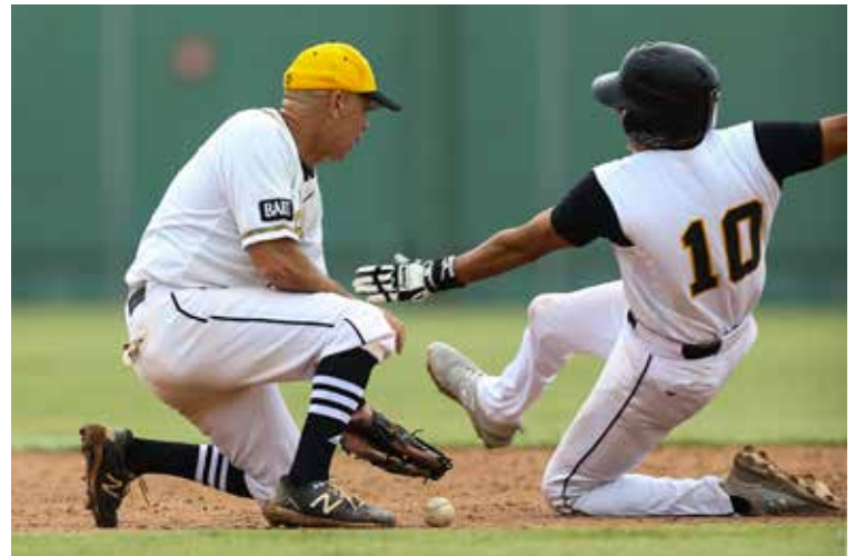
Chesapeake Rays baserunner slides in safely as the Chicago Knights 3rd baseman tries to get control of the ball