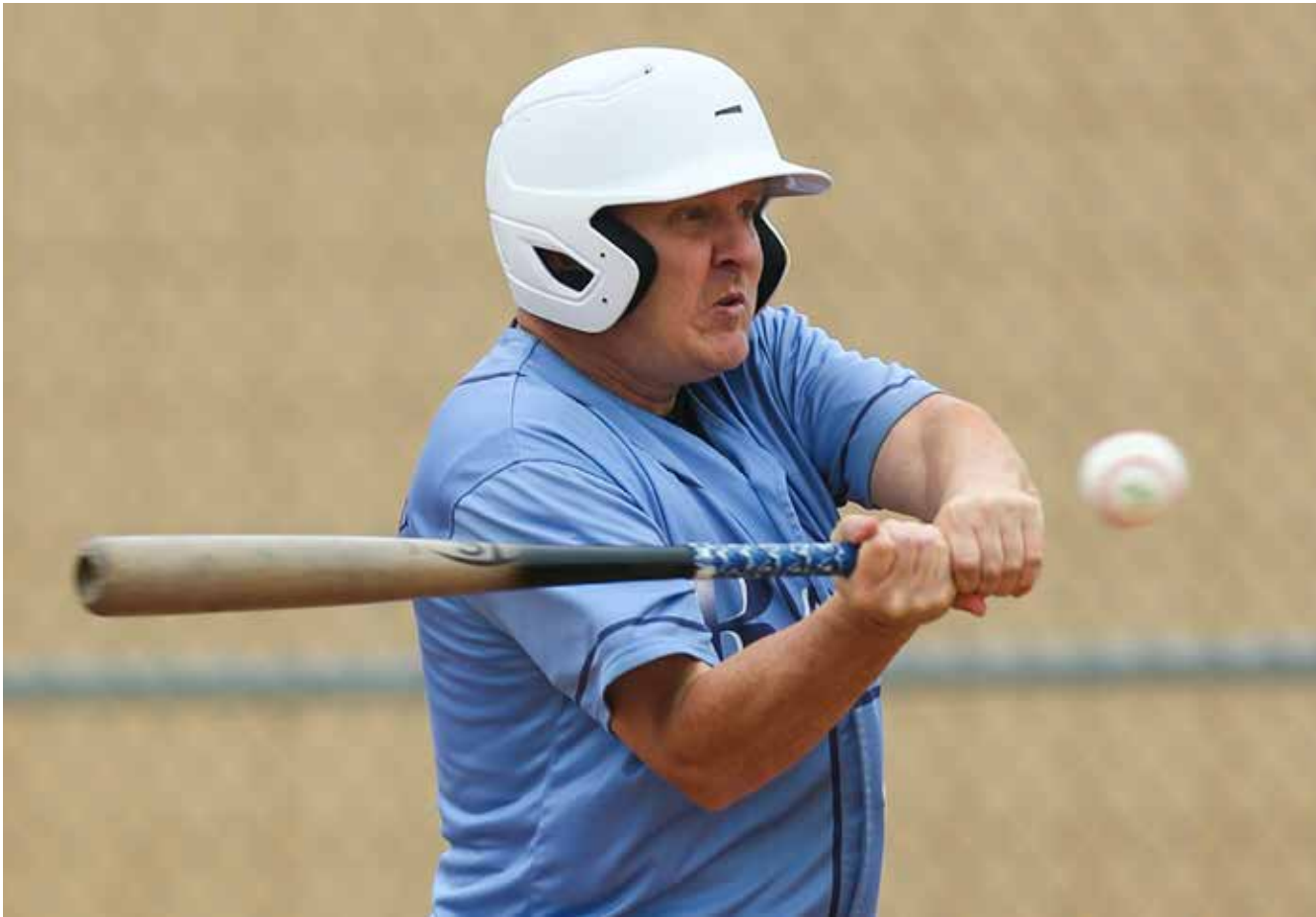
Chesapeake Rays batter takes a swing vs. the Chicago Knights