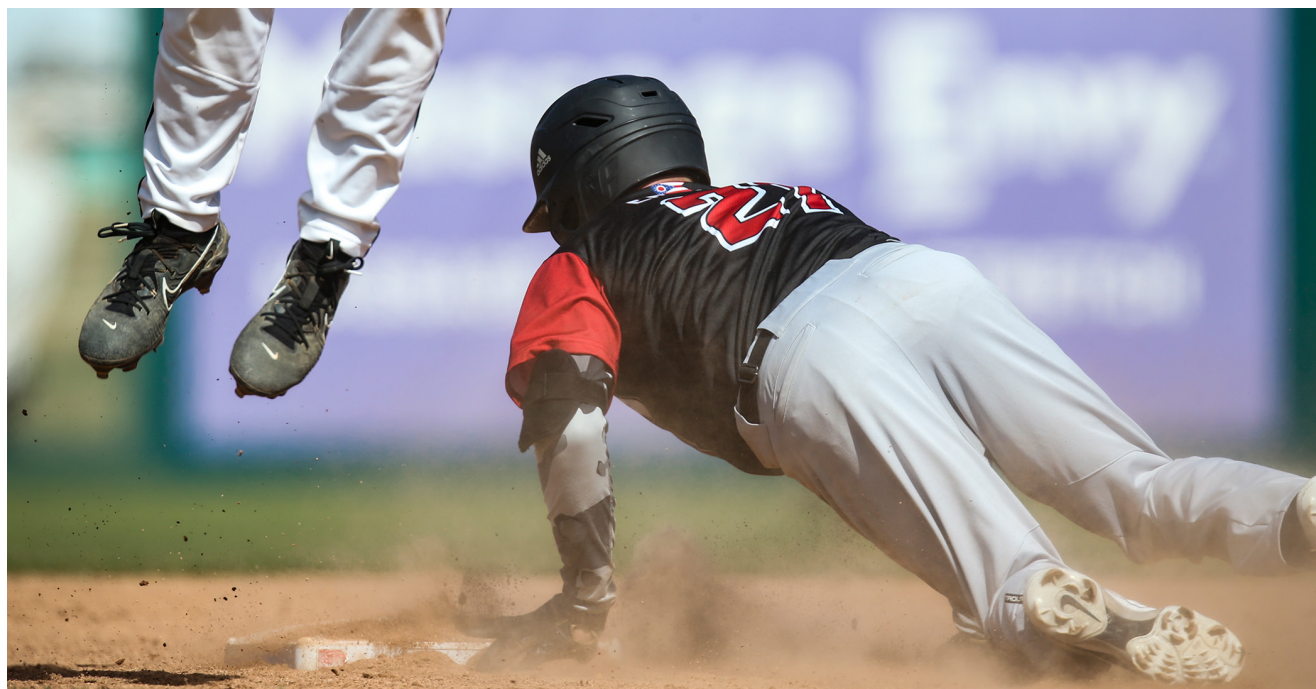
Akron Cardinals baserunner slides head first into 2nd vs. Twin Peaks Lumberjacks

Baltimore Chop @ Germain Ohio Aces, JBSt