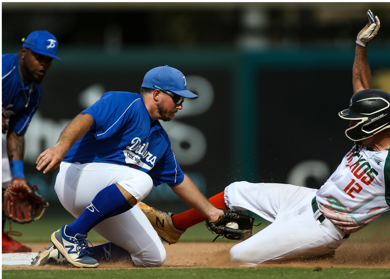
Jack-O's baserunner is out trying to steal 2nd vs. the Tidewater Drillers