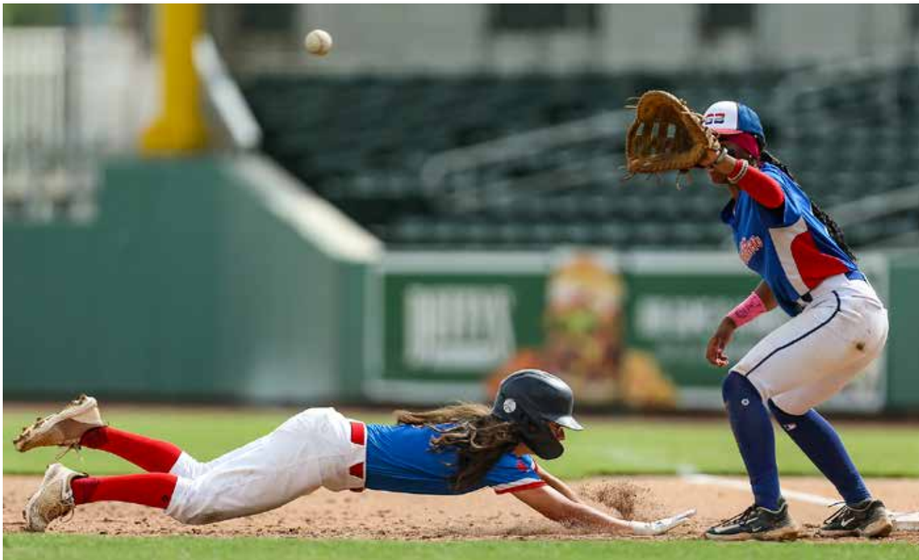
Two Rivers baserunner diving back to 1st vs. the Evolution

Minnesota Blenders 7, South Bend Cardinals 3 Minnesota Web Gems 5, Indiana Yankees 3 NEO Angels 11, Panhandle Pirates 7 South Florida Eagles 13, Tennessee White Lightnin' 4 Stars of Herrera 3, Vukgripz Akron A's 1 Tennessee White Lightnin' 10, Germain Ohio Aces 9 The Oilers 9, New Jersey Mets 5 Tidewater Drillers 6, T-Town Jack-Os 5 Twin Peaks Lumberjacks 16, Panhandle Pirates 11