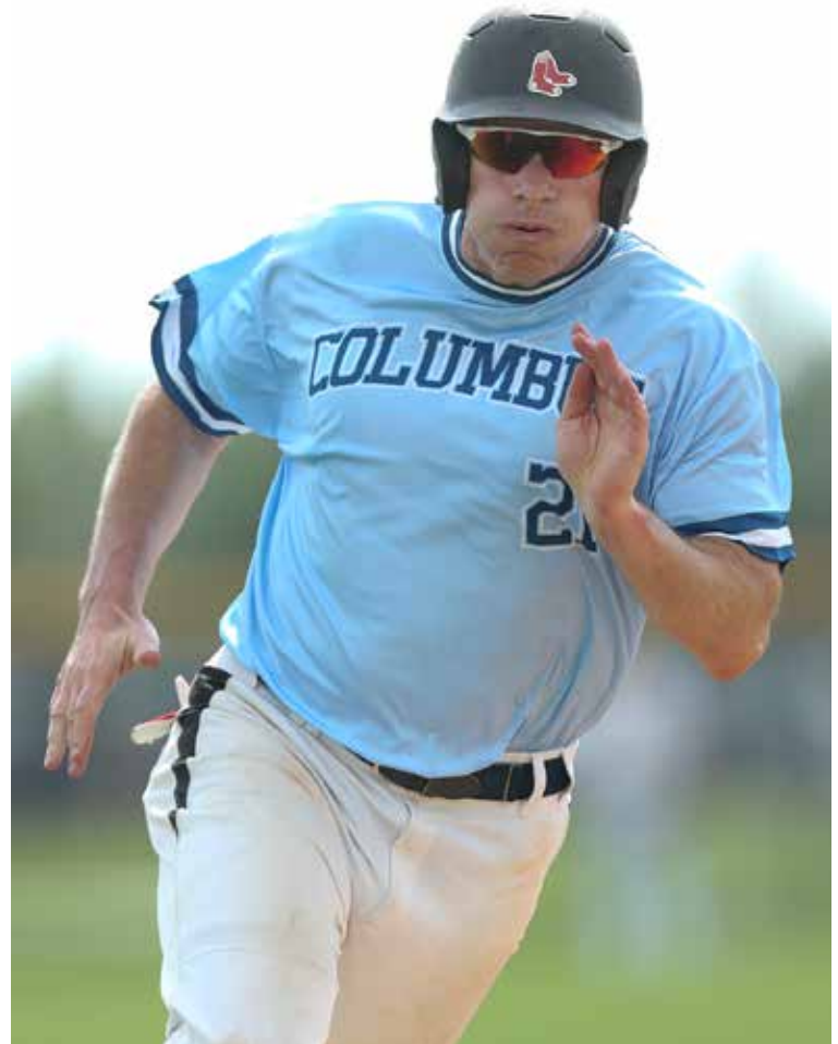
Rounding 3rd and heading for home it's the brown-eyed handsome man. Germaine Ohio Aces