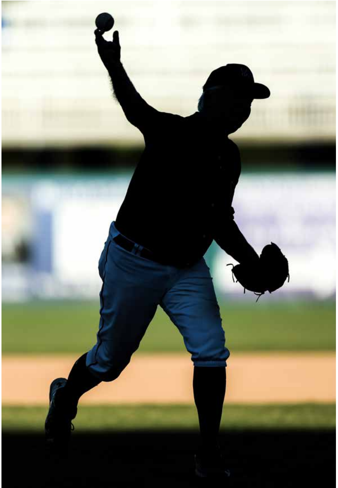
This is what the batter sees when shadows take over CenturyLink Stadium. Maine Woods 65's pitcher vs. Cincinnati Colts

Roy Hobbs field managers and key personnel are Red Cross First Aid certified , and Roy Hobbs Baseball has guidelines in place on the handling of injuries. Additionally, AED devices are available at each of the facilities, and Roy Hobbs personnel have been trained on those devices.