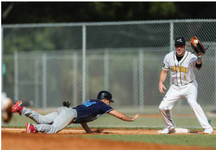
RusStar base runner dives safely back to first base vs. the Tennessee White Lightnin'

Chicago Knights 6, Glass City Black Sox 3 Chicago Woodpeckers 19, Minnesota Bulldogs 3 Chicago Woodpeckers 9, Indiana Yankees 5 Cincinnati Colt 15, Can-Am Padres 2 Cleveland Steve Sports 8, Rock Solid Americans 6 Detroit Dodgers 13, Germain Ohio Aces 3 Fort Myers Lumberjacks 20, Ukraine Baseball 7 Germain Ohio Aces 14, Chi-Sox 1 Glass City Black Sox 7, Panhandle Pirates 6 Indiana Yankees 12, Vukgripz Akron A's 0 Lakeville Lobos 15, Central Florida Bulldogs 4 Minnesota Blenders 14, Cobra Kai 2 Minnesota WebGems 14, Puerto Rico, Twins2 NEO Angels 17, Ukraine Baseball 4 Orlando Lugnuts 4, Chicago Giants 1 South Bend Cardinals 17, RusStar Baseball 14 Tennessee White Lightnin' 13, RusStar Baseball 12 Tennessee White Lightnin' 19, Cincinnati Colt 4 The Oilers 7, New Jersey Mets 6 (11) Tidewater Drillers 17, Minnesota Blenders 6 Tidewater Drillers 7, South Florida Eagles 5 TTown, Jack-Os 7, Akron Cardinals 4 TTown, Jack-Os 8, Baltimore Chop 2