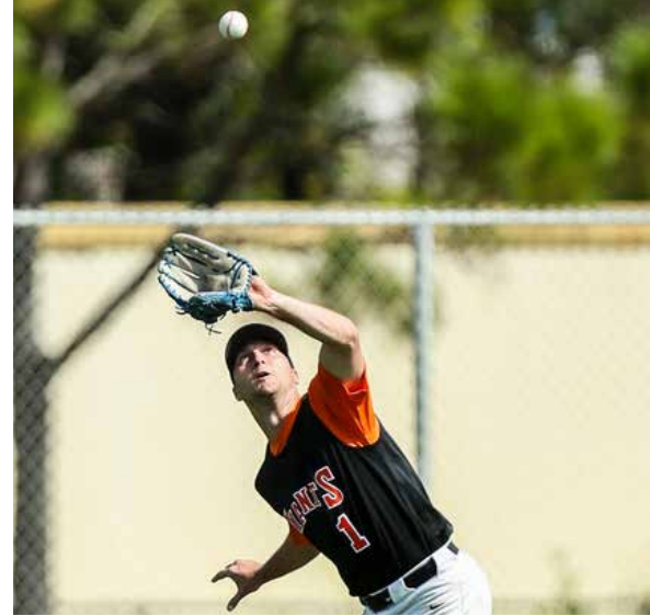
Chicago Giants left fielder tracks down an Orlando Lugnuts fly ball

Roy Hobbs field managers and key personnel are Red Cross First Aid certified , and Roy Hobbs Baseball has guidelines in place on the handling of injuries. Additionally, AED devices are available at each of the facilities, and Roy Hobbs personnel have been trained on those devices.