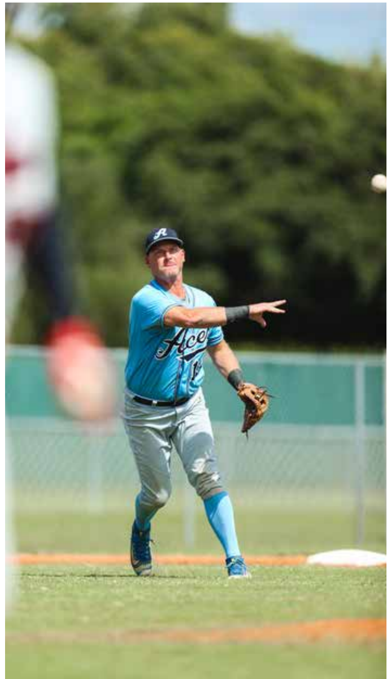
Germain Ohio Aces 3rd baseman had to charge the ball to make the play vs. the Chi-Sox