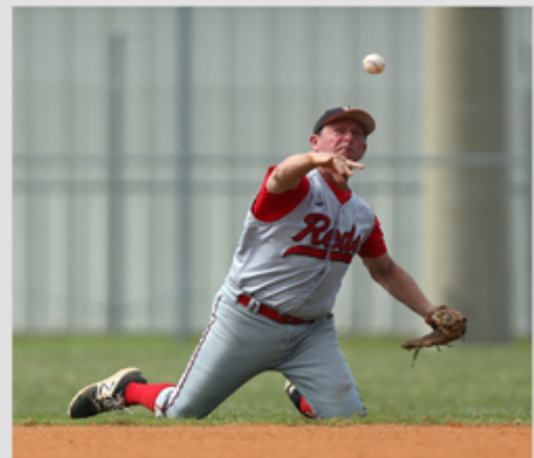
From his knees!!! Wright Field Reds vs. Baltimore Thunder

To view your Roy Hobbs photos go to: www.wagnerphotography.com