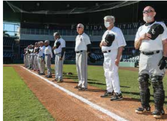
Tri-Cities Baseball honors America prior to the game against the Maine Woods 75s.