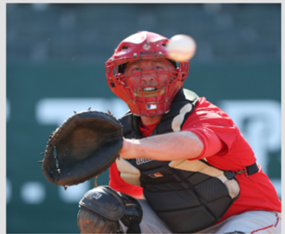
Wright Field Reds catcher warms up his pitcher.

To view your Roy Hobbs photos go to: www.wagnerphotography.com