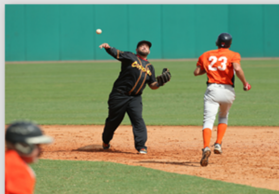
Cobra Kai turns a double play vs. the Flint Tigers at City of Palms Stadium

To view your Roy Hobbs photos go to: www.wagnerphotography.com