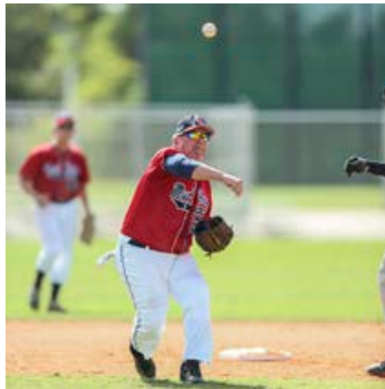
Kent Mudhens 75's shortstop makes the play vs. Tri Cities

Baltimore Baseball Club 13, North Coast Nationals 12 Livingston Dodgers 21, Wilmington NC Thunder 3 MBI Baseball 22, Maine Woods Baseball 3 Michigan Stars 8, ASBA Indians 3 Midwest Nine 21, Raynham Baseball Club 16 Minnesota Bees 19, Youngstown Astros 4 NorCal Antiques 26, Naturals 16