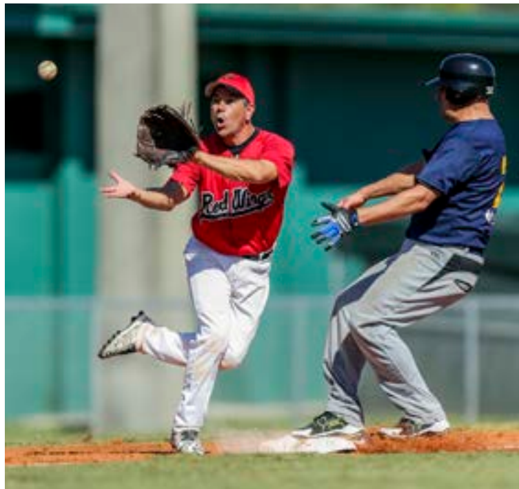
Chesapeake Red Wings 3rd baseman takes a late throw vs. the Ukraine team

Maine Indians 6, Oakville Golden A's 2 – PDC-2 A's: PITCHING A. Schiralli 3 IP, 0 R, 4 K; BATTING: S. Pepi 1 RBI; M. Snider 1 RBI