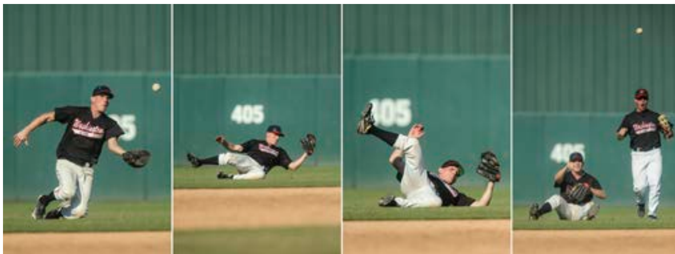
Washington All-Stars center fielder makes an outstanding catch of a short fly ball vs. the Canton Tigers