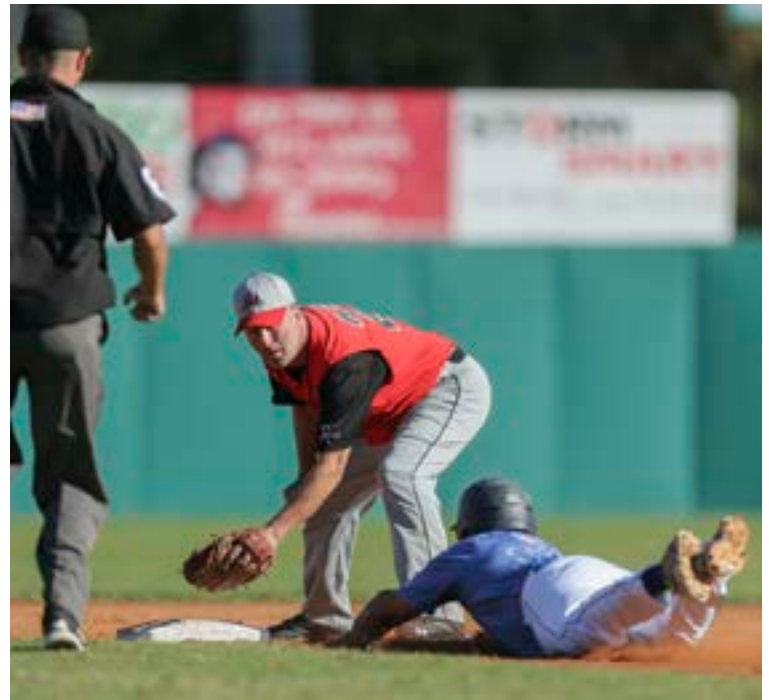
Minnesota Bandits 2nd baseman about to tag out a CWC Baseball Club batter trying to stretch a single into a double

Baltimore Astros – 26, Nova Scotia Monarchs - 1 Baltimore Astros - 13, Bellacino's Red Sox – 2 Baltimore Thunder – 15, St. Paul Senators - 8 Cangrejeros RD - 7, Chicago Knights – 1 Carolina Thunder – 17, New England Indians - 11 Chesapeake Redwings - 11, Ukraine Masters – 8 Chicago Giants – 12, Baltimore Thunder - 2 Cincinnati Colt .45s - 5, Kodak Reds - 17 CWC Baseball Club - 16, Dayton Wolves - 6 DuPage Indians - 16, Cincinnati Colt .45s – 4 Ft. Myers Brewers - 18, Victoria Mussels - 6 HPK Oilers - 11, Glory Days - 9 Kent Mudhens - 14 Tallahassee Bombers – 4 Lake Erie Blue Jays - 7, Chicago Colts - 0 Lake Erie Blue Jays – 14, Ukraine Masters - 4 Lansing Blue Jays – 19, PSOF Rangers - 7 Maine Indians - 16, Orlando Braves - 4 Maine Indians – 18, Kenmore Orioles – 3 MaxBat – 19, Jersey Shore Baseball - 9 Midwest Pirates - 11, DuPage Indians - 4 Minneapolis Millers - 10, Chicago North Redhawks - 4 Minneapolis Millers – 12, New Jersey Thunder - 2 New England Indians – 18, Bellacino's Red Sox - 1 NW Indiana Dogs - 12, Jet Box - 7 Oakville Golden A's – 9, Ft. Myers Hooter's Blues - 5 Orlando Brewers – 17, Harry Young Builders - 16 Pittsburgh 45s – 5, Minnesota Bandits - 3 St. Paul Senators – 8, PSOF Rangers - 7 Tennessee Dirtbags – 4, Chicago North Redhawks - 2