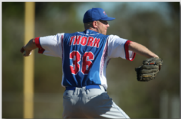
Stars Baseball Academy starting pitcher vs. Estrellas de Herrera.

To view your Roy Hobbs photos go to: www.wagnerphotography.com