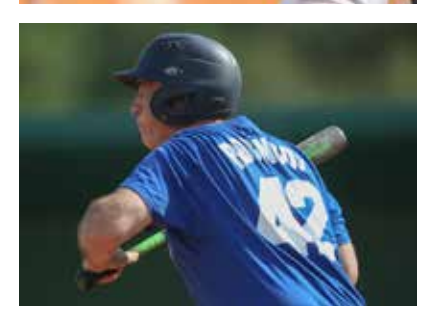
Scenes from Thursday's Hall of Fame celebration at Terry park.