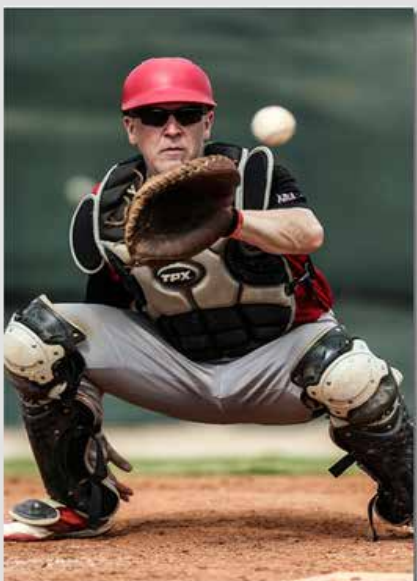
Minnesota Bandits catcher warms up the pitcher before an inning vs. the NW Indiana Dogs.

To view your Roy Hobbs photos go to: www.wagnerphotography.com