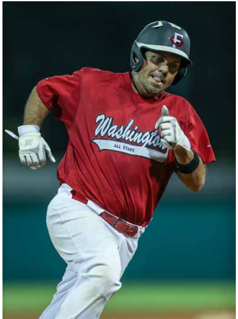
Washington All-Stars baserunner rounding 3rd and heading for home vs. the Victoria Mussels

Atlanta Twins 8, DuPage Indians 5 Bellacino's Red Sox 8, Nova Scotia Monarchs 7 Cangrejeros RD 11, WinBerg Construction 6 Chicago Colts 18, Kodak Reds 3 Chicago Knights 10, Baltimore Thunder 2 Chicago North Redhawks 13, Tennessee Dirtbags 3 Chicago Woodpeckers 11, Glory Day's 2 Crystal Clinic Indians 18, Bellacino's Red Sox 9 CWC-Krueger's Krew 8, Minneapolis Millers 2 Dayton Wolves 12, Swinging Diablos 2 Doc Ford's Sea Dogs 10, Canton Tigers 6 Jersey Shore Baseball 9, Oakville Golden A's 4 Kenmore Orioles 20, Cincinnati Colt .45s 13 Kenmore Orioles 20, Huntsville Havoc 6 Kent Mudhens 12, St. Paul Senators 1 Kent Mudhens 13, Baltimore Astros 3 Lake Erie Blue Jays 10, Chesapeake Redwings 2 Lake Erie Blue Jays 14, PSOF Rangers 3 Lehigh Valley Railriders 24, Carolina Thunder 7 Maine Indians 10, Windy City Warriors 9 New Jersey RailRiders 20, Nova Scotia Monarchs 15 NW Indiana Dogs 12, Minnesota Bandits 4 NW Indiana Dogs 8, St Louis Pirates 1 Orlando Braves 12, Jet Box 6 Orlando Braves 16, Cincinnati Colt .45s 0 Pittsburgh 45s 6, New Jersey Twins 2 PSOF Rangers 11, Ft. Myers Hooter's Blues 8 St. Paul Senators 12, Ukraine Kozaks 2 Staten Island Bombers 13, HPK Oilers 7 Tidewater Drillers 13, Chicago Cardinals 2 Washington All Stars 14, Victoria Mussels 4 Windy City Warriors 14, Lansing Blue Jays 4 Winnepesaukee Muskrats 15, Chicago Knights 11