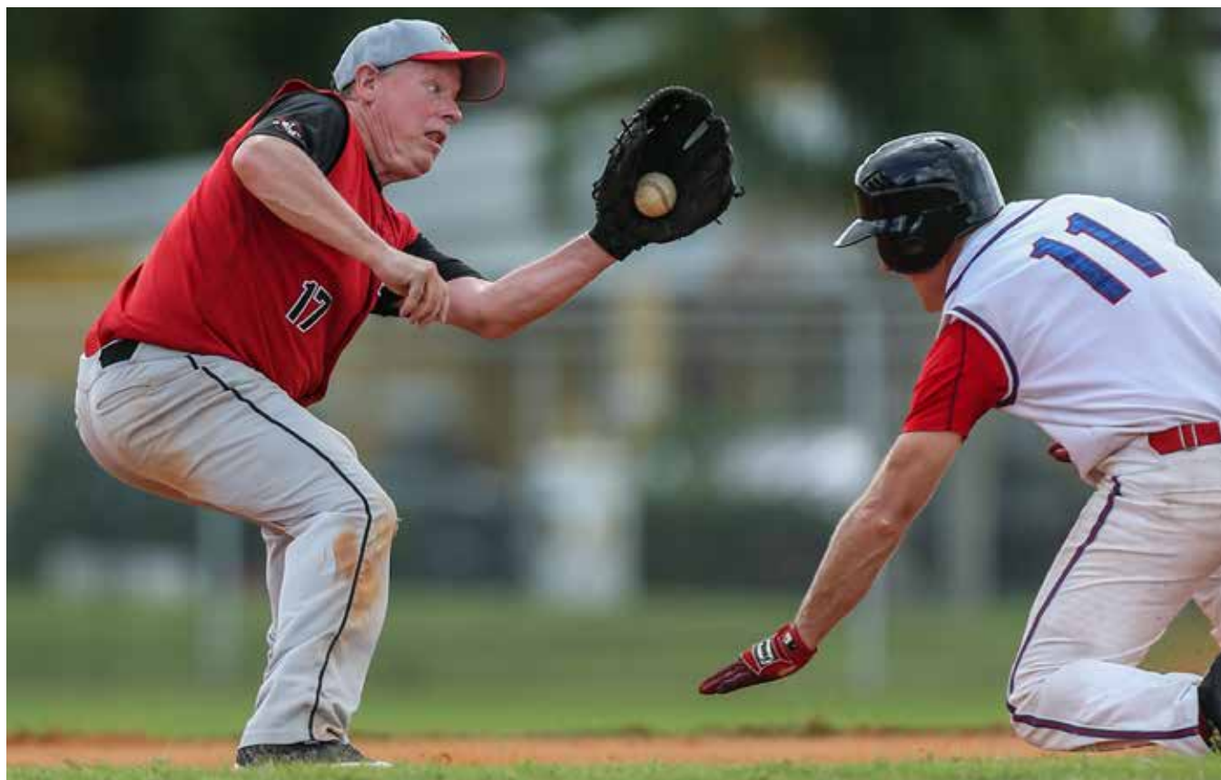
MN Bandits vs. NW Indiana Dogs