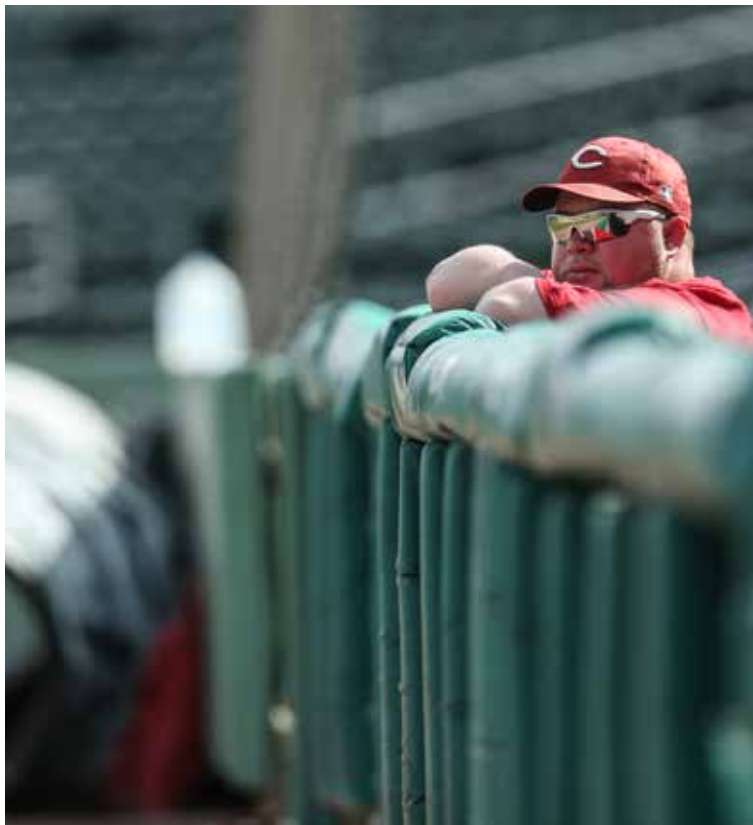
Kodak Reds dugout vs. Bellacino's Red Sox.