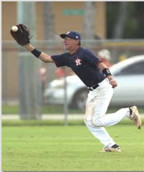
Baltimore Astros center fielder makes a nice running catch of a PSOF fly ball.

To view your Roy Hobbs photos go to: www.wagnerphotography.com