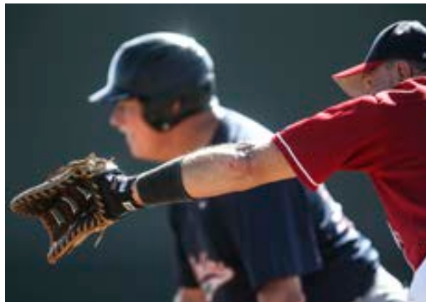
Mudhens 65's 1st baseman holds on a USA Volkers Group runner