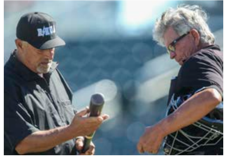
Umpires trying to determine if a bat is legal during the Minneapolis Millers/Jet Box game

Baltimore Astros @ Bellacino's Red Sox JB5 Baltimore Thunder @ Chicago Giants JB3 Canton Tigers @ Washington All-Stars CL-S Carolina Thunder @ New England Indians JB6 CWC Baseball Club @ Dayton Wolves PDC5 DuPage Indians @ Cincinnati Colt .45s CL3