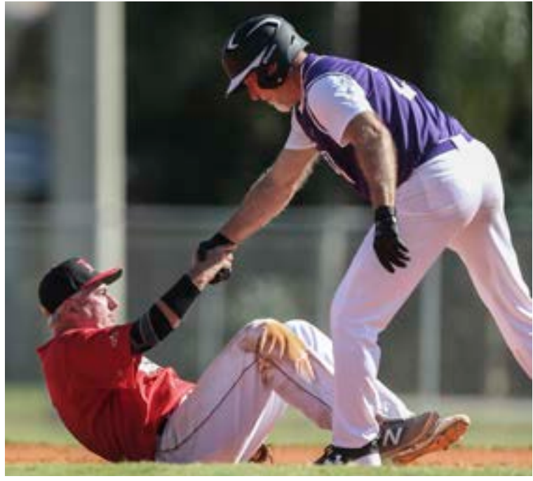
Sportsmanship. Carolina baserunner gives the Washington All-Stars 2nd baseman a hand