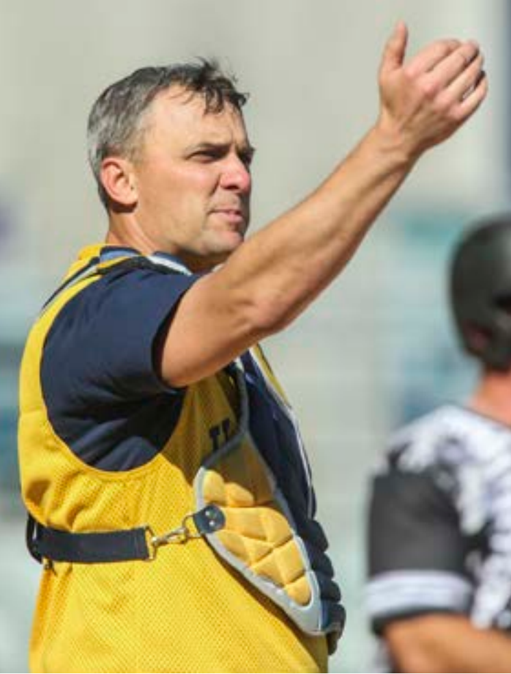
Ukrainian catcher positions the defense vs. the TN Dirtbags