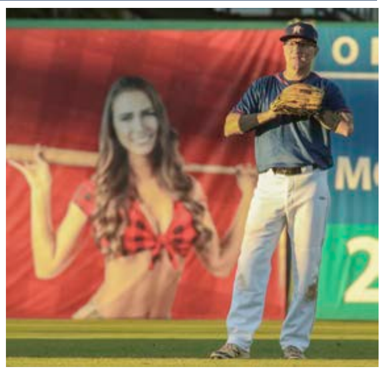
Baltimore Astros center fielder tries to stay focused on the game.