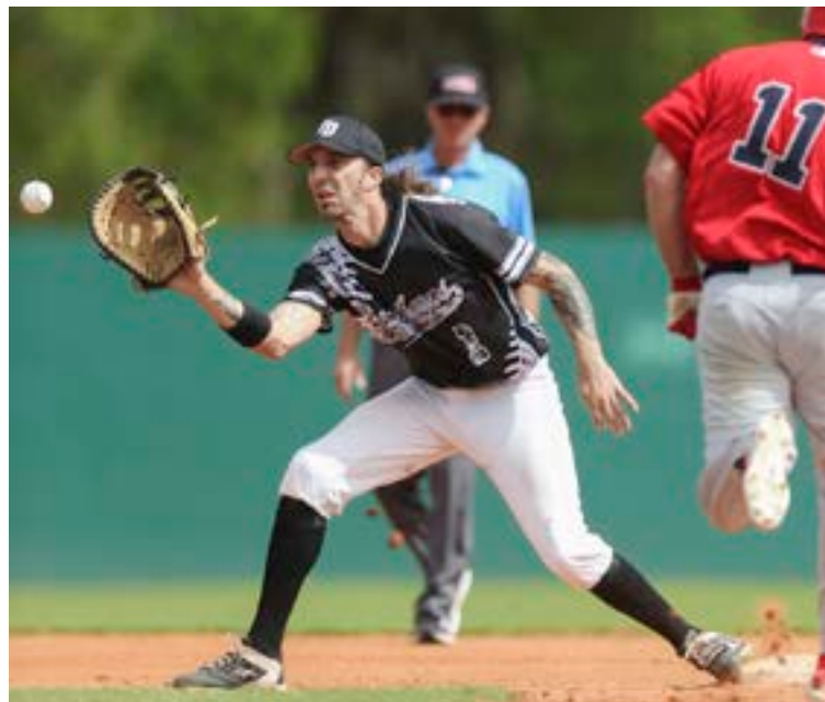
Tennessee Dirt Bags 1st baseman takes the throw vs. Bellacino's Red Sox.