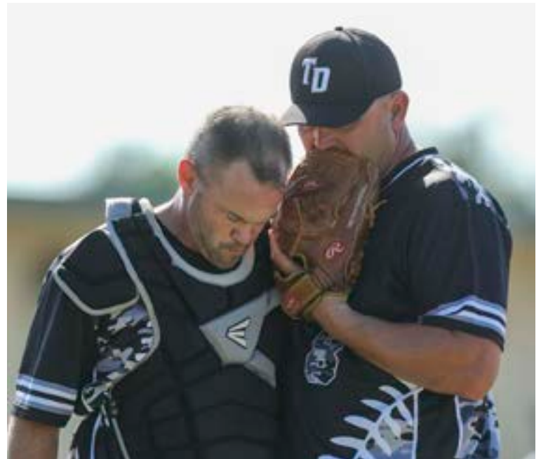
Tennessee Dirtbags battery discussing strategy vs. the South Bend Cardinals