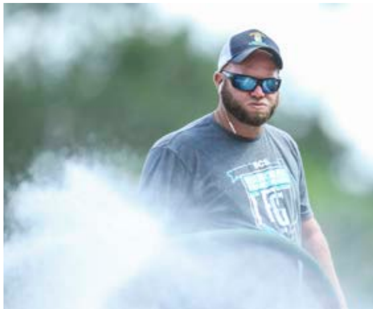
City of Palms grounds crew preps the field for the afternoon game