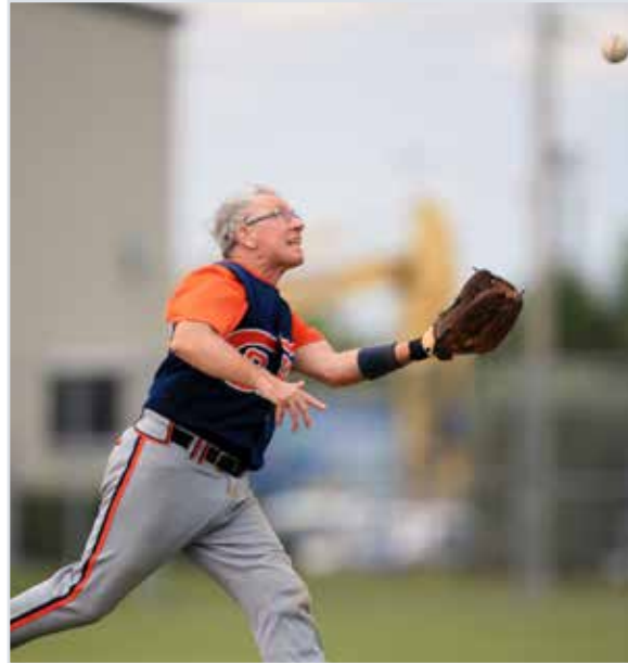
Cincinnati Colt .45's shortstop catches a Kent Mudhens infield pop fly.

When your games are over and you are leaving the dugout, please police it for trash and cups, etc. Your assistance in cleaning up the dugouts each day will be greatly appreciated.