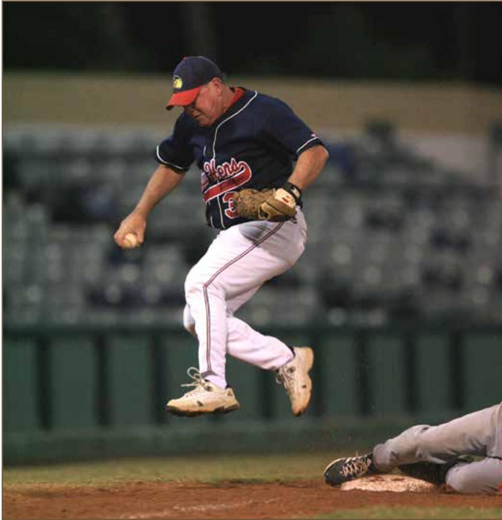
Kent Mudhens 3rd baseman leaps to avoid a Team Sports Pro runner's spikes.