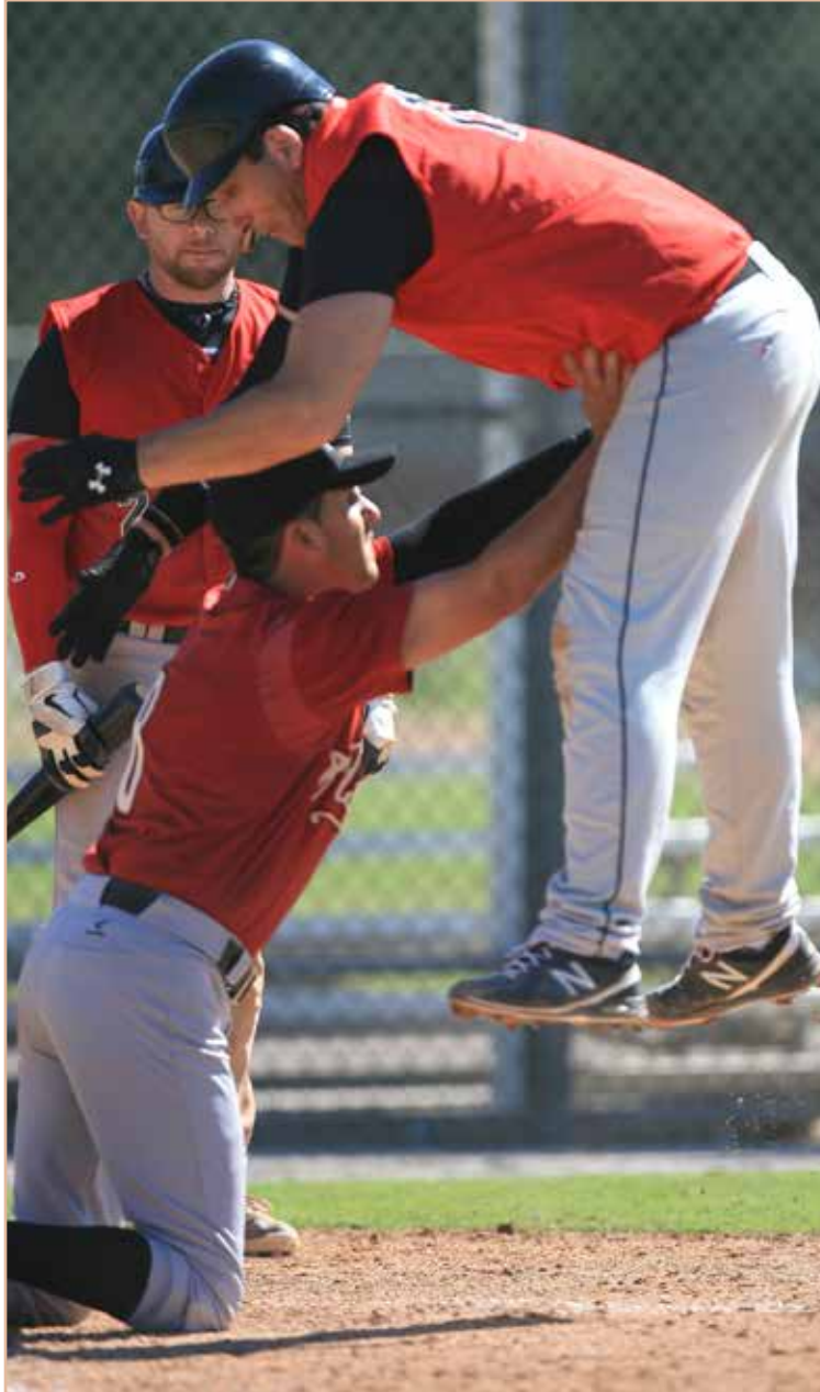
Despite the use of an unorthodox maneuver to avoid the tag, the Minnesota Bandits runner is out at the plate vs. the DRS Astros.

These individuals will have a view of the parking lot, and they will be available in emergencies, be enforcing cooler guidelines and handling admissions.