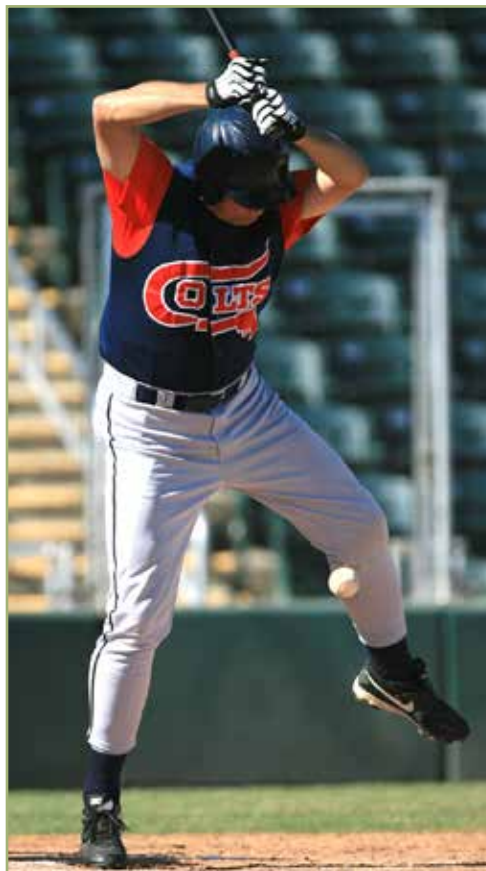
Hawkeye Pierce of the Cincinnati Colts dances to avoid an inside pitch