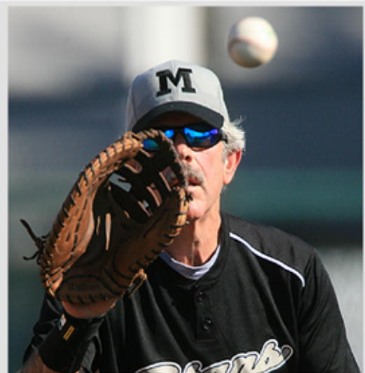
Michigan Stars 1st baseman