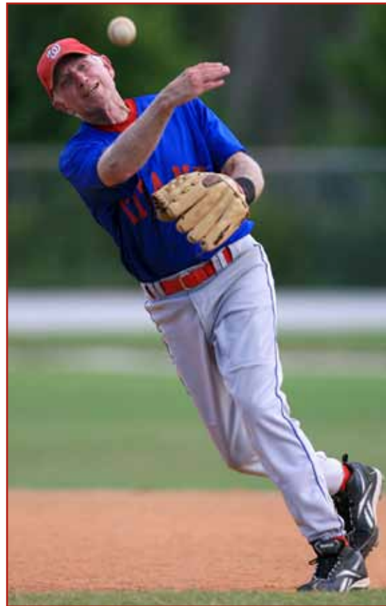
Washington Titans shortstop makes a good play vs. the Nationals