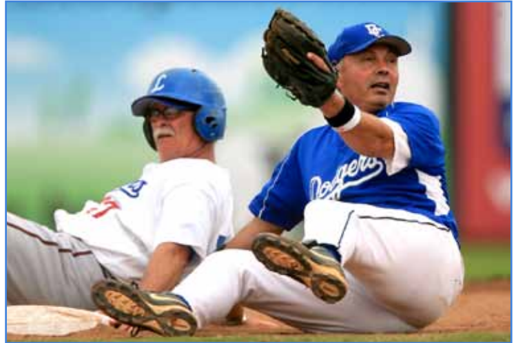
Dodger vs. Dodger: Livingston Dodger slides into 2nd base covered by a DC Dodger infielder