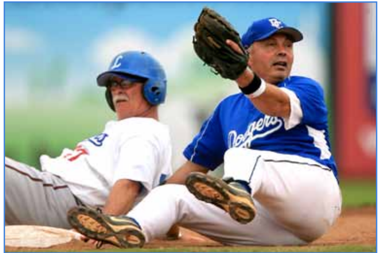
Dodger vs. Dodger: Livingston Dodger slides into 2nd base covered by a DC Dodger infielder