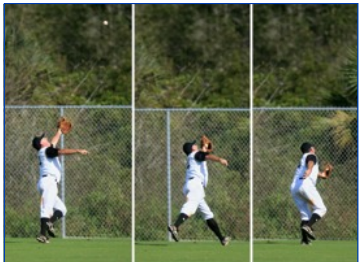
PSOF center fielder makes a spectacular running catch vs. the Fort Myers Hooters Blues