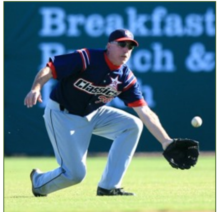
DC Classics center fielder makes a great catch vs. HPK