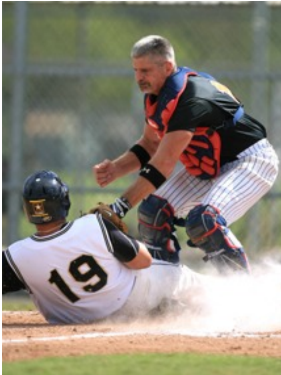
Fort Myers Hooters Blues catcher tags a PSOF Rangers runner out at the plate